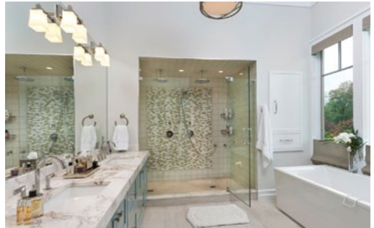
LoParco master bath

In Greenwich, this fabulous shingle & stone home by LoParco Associates is built like a boat in the excavated area because of a very high water table. A redundant water mitigation system uses 4 well points that can sustain pumping water in a major storm, and the porous asphalt driveway mitigates the use of Cul-Tec drainage systems.