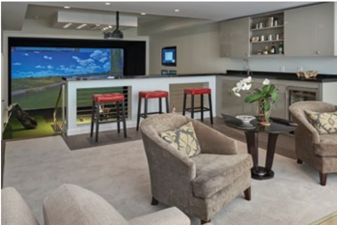
LoParco special purpose room